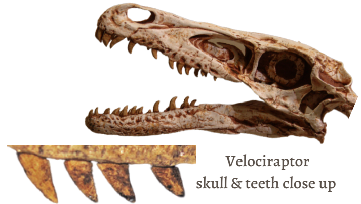
Velociraptor skull & teeth close up