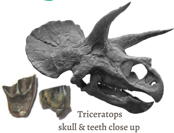
Triceratops skull & teeth close up