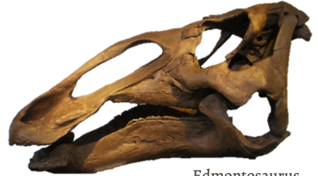
Edmontosaurus skull & teeth close up