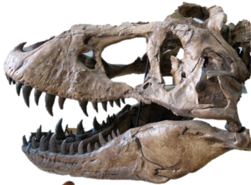
Tyrannosaurus Rex skull & tooth close up