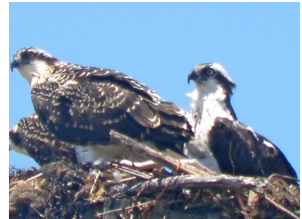
Napatree Point Ospreys.

Improving map accuracy and adding new nests: Where there were errors or inaccuracies in the original osprey map, volunteers were able to suggest changes. In some cases, key volunteers were added as Google map editors so they could make changes and additions from home based on their observations. A special thanks goes out to Butch Lombardi and Steve Reinert, who helped to clarify the locations of the many osprey nests in the Palmer River area—and added a few more!