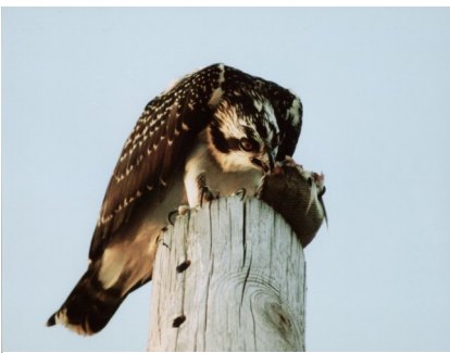
Young osprey feeding at Freebody Park in Newport.

Audubon Society of RI is proud to bring back the RI Osprey Monitoring Program! Initiated in 1977 by Rhode Island Department of Environmental Management (RIDEM), the project was established to monitor