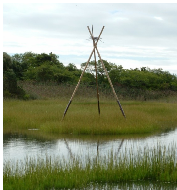
New platform awaits osprey in Hazard Marsh.

Audubon Society of RI installed a new osprey platform in its Ocean Drive Marsh conservation refuge, located on Hazard Road in Newport. Protected by Audubon since 1967, Ocean Drive Marsh is 10 acres of salt marsh and open water along the southwestern Newport coast. The platform is a tripod design, which will be more stable than a single post on soft marsh soils. Audubon will be watching closely to see if this platform is adopted by an osprey pair in 2011!