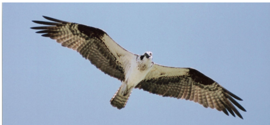
Osprey in flight.