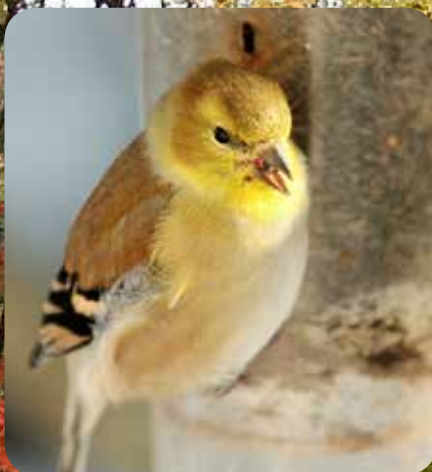
Goldfinch by Butch Lombardi