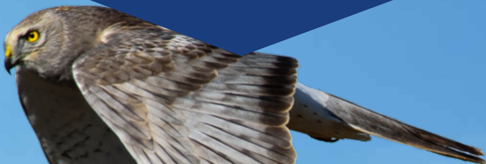
Northern Harrier and Harlequin Ducks