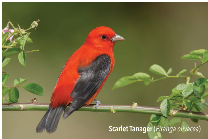
Scarlet Tanager ( Piranga olivacea )