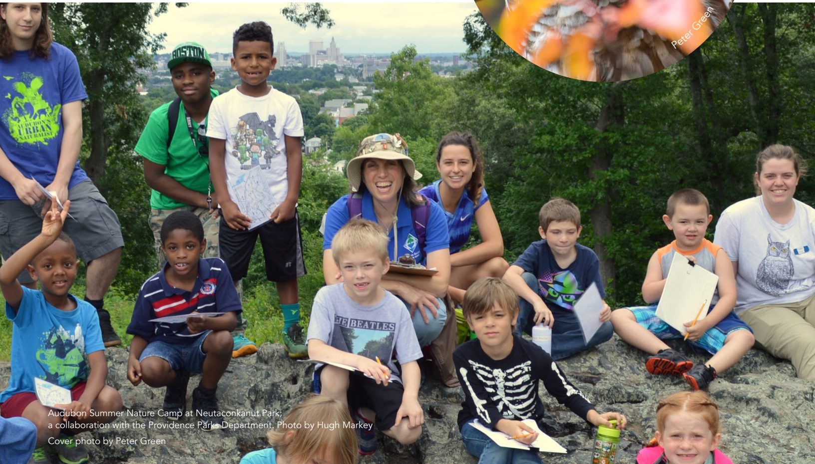
Audubon Summer Nature Camp at Neutaconkanut Park; a collaboration with the Providence Parks Department.